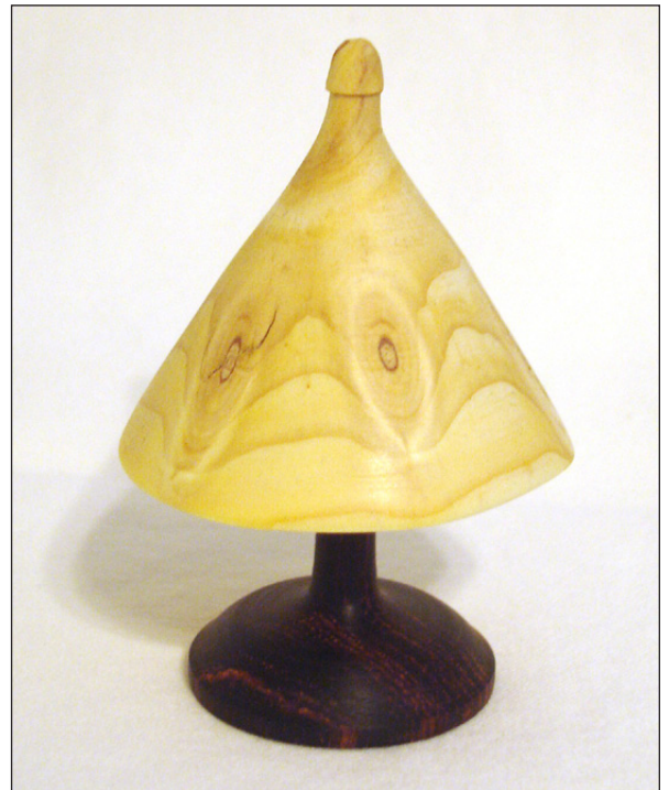
Decorative category winner: Erika Kendra, Inverted top from a christmas tree