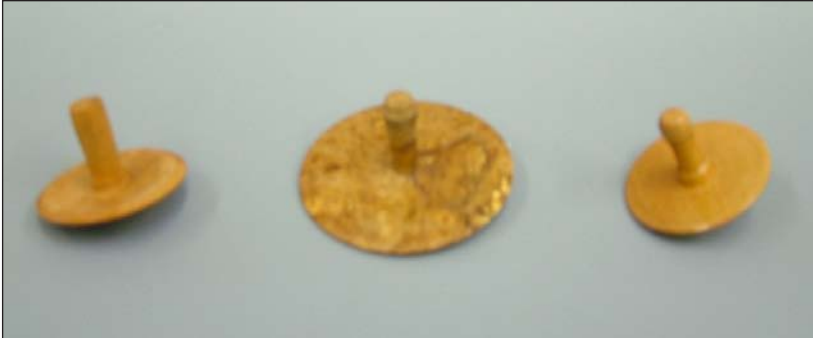
Keith Pipoly, Three tops