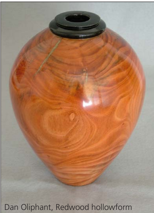
Dan Oliphant, Redwood hollowform