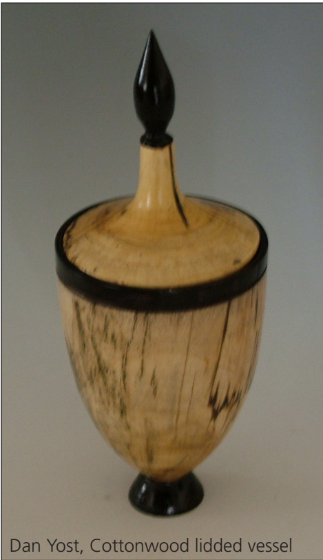
Dan Yost, Cottonwood lidded vessel