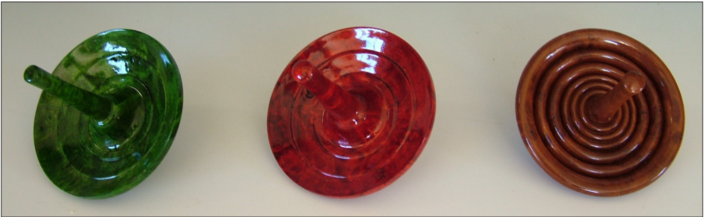
Functional category winner: Martin Littleton