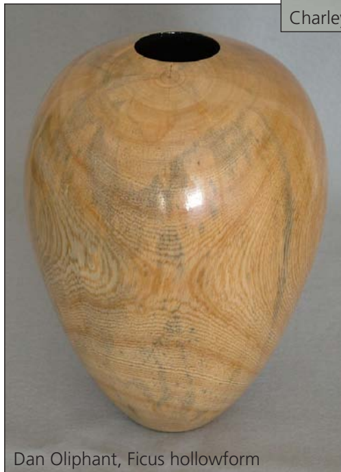
Dan Oliphant, Ficus hollowform