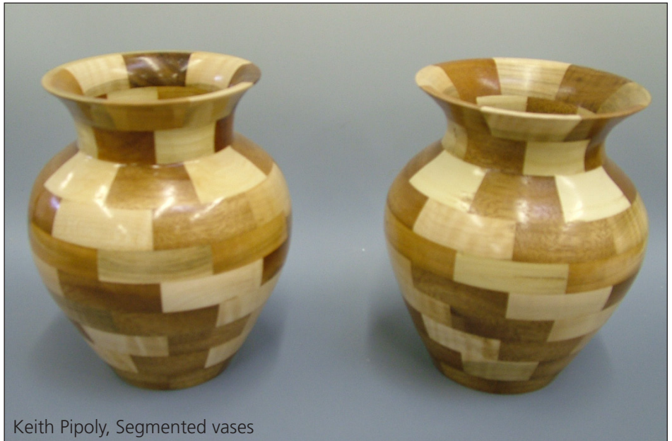
Keith Pipoly, Segmented vases