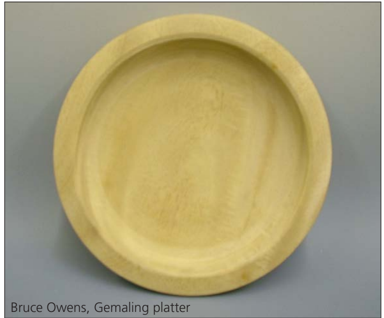
Bruce Owens, Gemaling platter