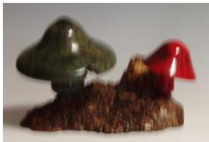
Buckeye Burl, dyed red and green setting on Buckeye with bark.