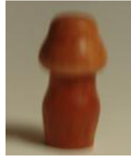
Erika Kindra's Red Milkwood mini toad stool