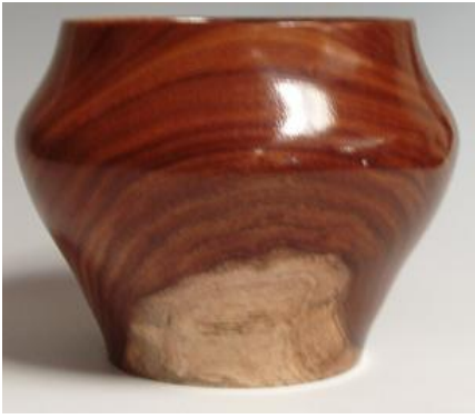
Black Acacia Bowl Keith Pipoly